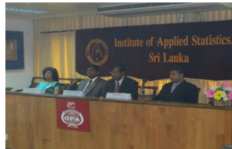
Head Table - Academic sessions